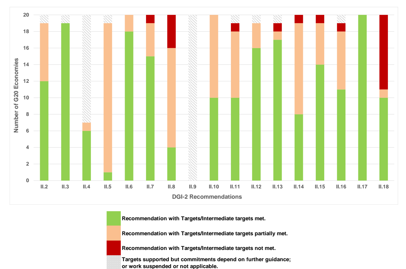
Figure 2. Overview of Implementation Status for DGI-2 Recommendations at end-2021

20. The remaining challenges in implementing the DGI-2 recommendations stem from a wide range of factors including reprioritization of work due to the COVID-19 pandemic, challenges in data collection and in obtaining appropriate resources. Although DGI-2 was extended by six months to December 2021, the COVID-19 pandemic has slowed down progress since the beginning of 2020 and posed significant challenges for the full implementation of some targets for those economies where the respective recommendation was not yet achieved. Meanwhile, many data compilers in participating economies faced significant challenges in keeping adequate human resources with expertise and/or developing appropriate expertise for their staff.