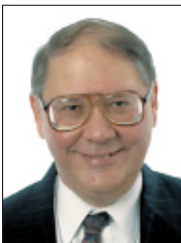
Michael Mussa is Chief Economist and Economic Counsellor of the IMF and Director of its Research Department.

generally be an attractive component of a broader program of liberalization. Such liberalization need not occur all at once; for countries that face the prospect of large surges of inward investment, a gradual approach may be advisable. It generally makes little difference if foreign investment is limited in some selected sectors of the economy. The financial sector, however, is an important exception. Opening domestic financial markets to participation by foreign (or multinational) financial institutions is an integral element of full capital market liberalization. There can be important benefits, especially for smaller countries, from the diversification of risks that is made possible when banks can operate across national boundaries.