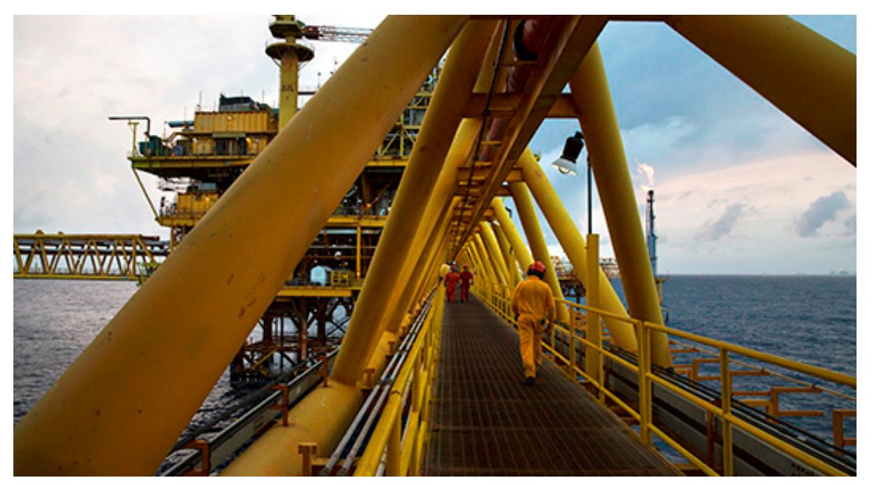
An employee walks on a bridge on an offshore oil rig about 65 miles from Ciudad del Carmen in Mexico.