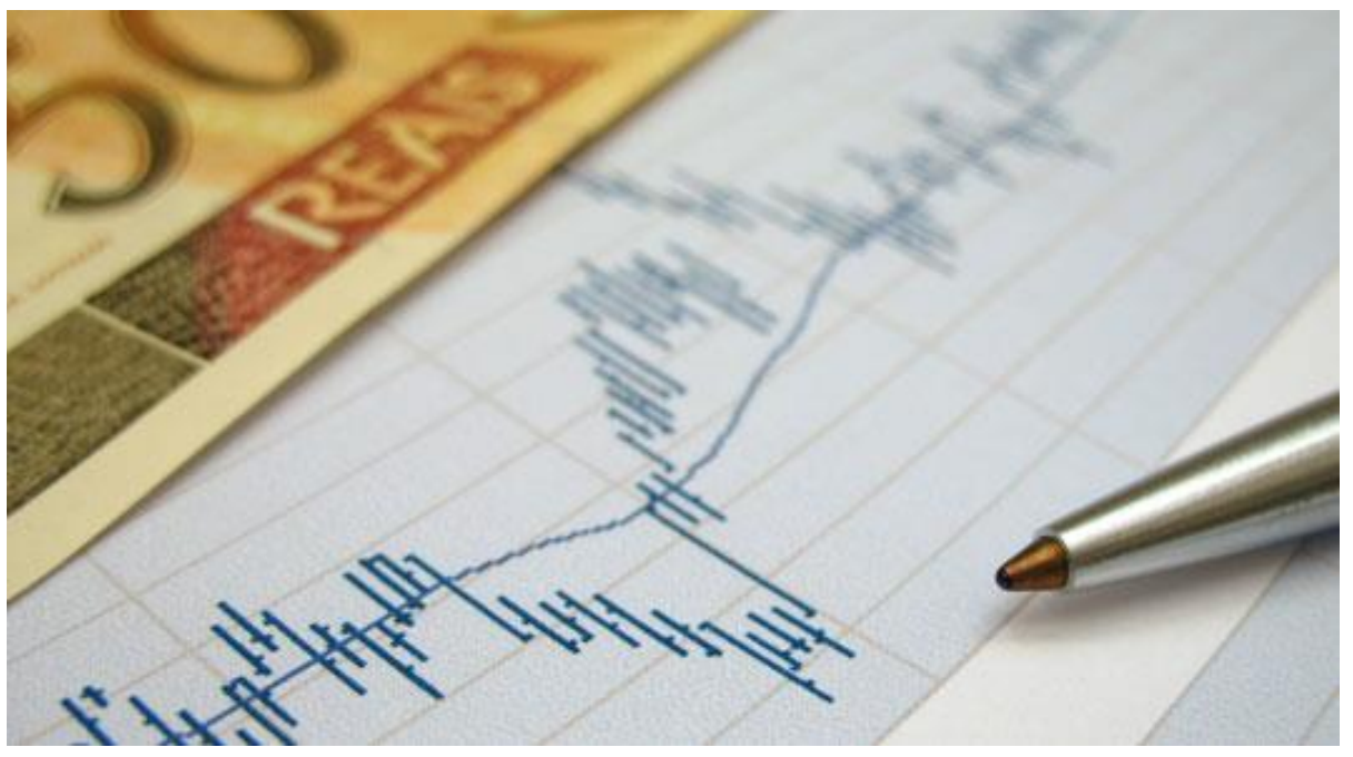
Brazil's new spending rule will help the country control spending growth

Brazil is emerging from a deep recession. While the country is expected to register positive growth in 2017, the crisis left deep scars in Brazil's public finances. From 2013 to 2016, the primary budget balance, which excludes interest payments, tumbled from a surplus of 1.7 percent to a deficit of 2.5 percent of GDP, and public debt increased by almost 20 percentage points. The impact of the downturn was magnified by long-standing structural fiscal problems.