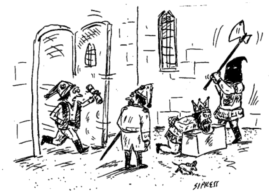
"Stop! Wait! Government's no longer the problem—it's the solution!"

"Stop! Wait! Government's no longer the problem – it's the solution!