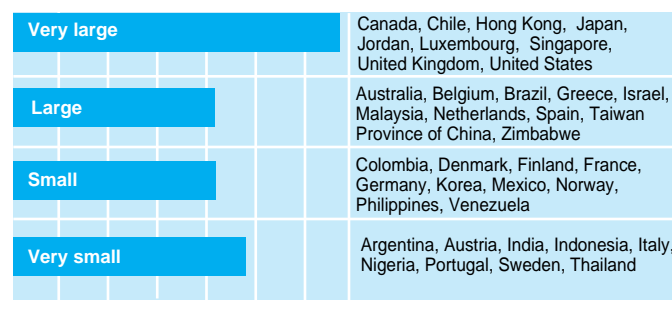
Chart 4 Initial market size (1976) and subsequent economic growth (1976–93)

0 \quad 0.5 \quad 1.0 \quad 1.5 \quad 2.0 \quad 2.5 \quad 3.0 \quad 3.5