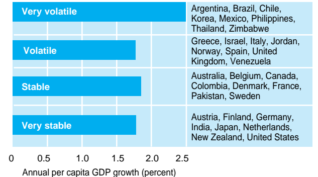
Chart 5 Initial volatility (1976) and subsequent economic growth (1976–93)