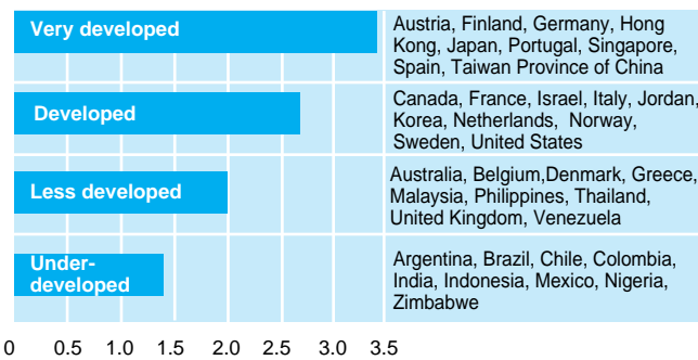
Chart 6 Initial banking development (1976) and subsequent economic growth (1976–93)