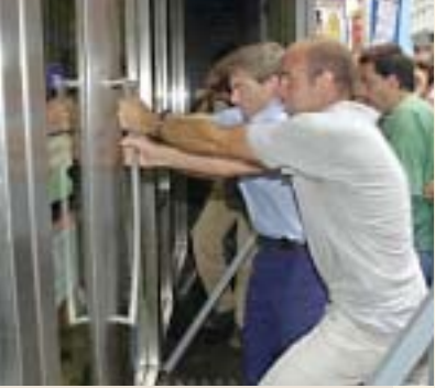
Argentines protesting the freezing of their savings storm a bank entrance, 2002.