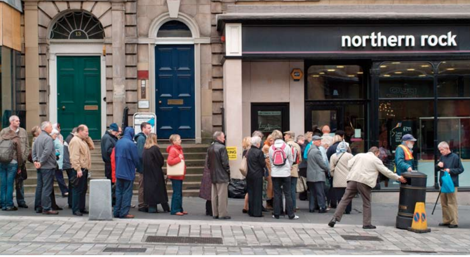
Run on the United Kingdom's Northern Rock bank, a fallout from the U.S. subprime crisis.