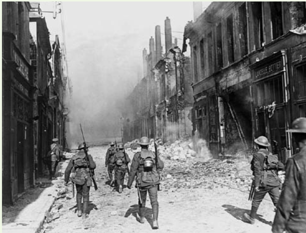
U.K. forces march into Cambrai, France, during World War I.