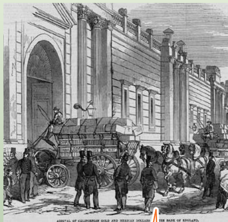
Gold bullion from California delivered to Bank of England in 1849.

The BoE assumed a further central banking role in the mid- to late 1800s by becoming lender of last resort during a succession of domestic banking crises. As expanding local and international commerce led to the formation of large clearing banks, the BoE stood behind the retail banking system as a supplier—and controller—of liquidity.