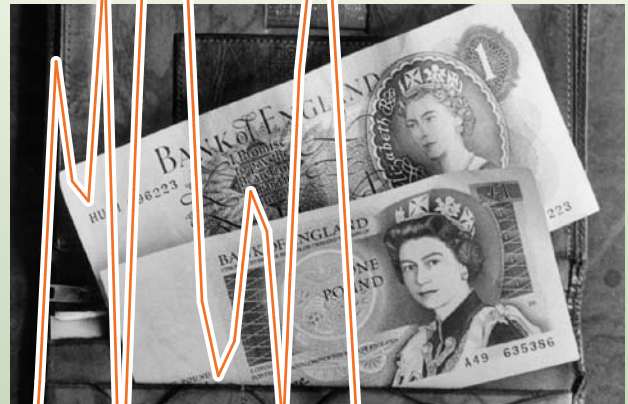
Old-style one-pound notes, since replaced by coins.

The BoE was successful in bringing inflation down to safer levels in the 1980s. Its capacity to keep future inflationary pressures in check was further strengthened when the BoE was granted full operational independence for monetary policy in 1997. Freed from political influence and equipped with a clear mandate for price stability, the BoE has managed to keep inflation on target over the past decade. Its credibility has also allowed the BoE to move aggressively in easing monetary policy in recent months as the financial crisis unfolded.