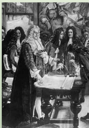
Founding of Bank of England by royal charter in 1694.