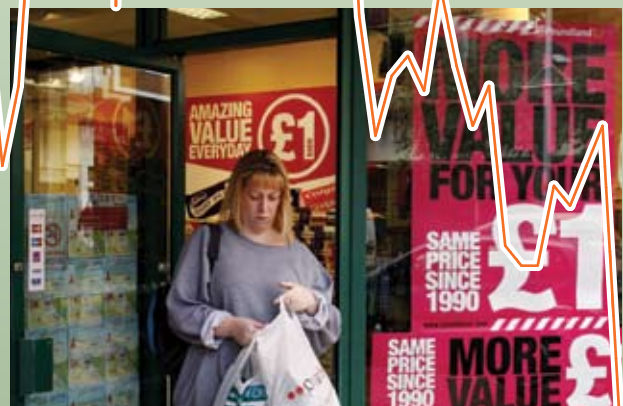
BoE has kept inflation on target over the past decade.