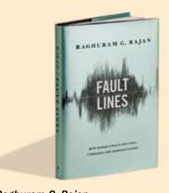
Raghuram G. Rajan

The book covers a broad group of such fault lines—indeed, this is virtu-