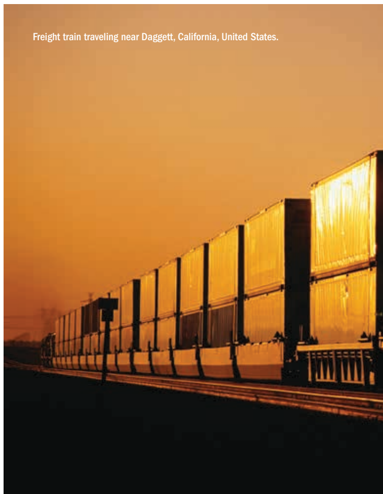
Freight train traveling near Daggett, California, United States.

selection bias: they reduced tariffs only on products of interest to themselves. If the developing economies had been able to make reciprocal concessions, this product-selection bias would have largely disappeared.