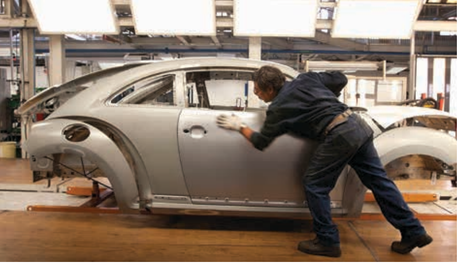
Employee on Volkswagen Beetle production line in Puebla, Mexico.