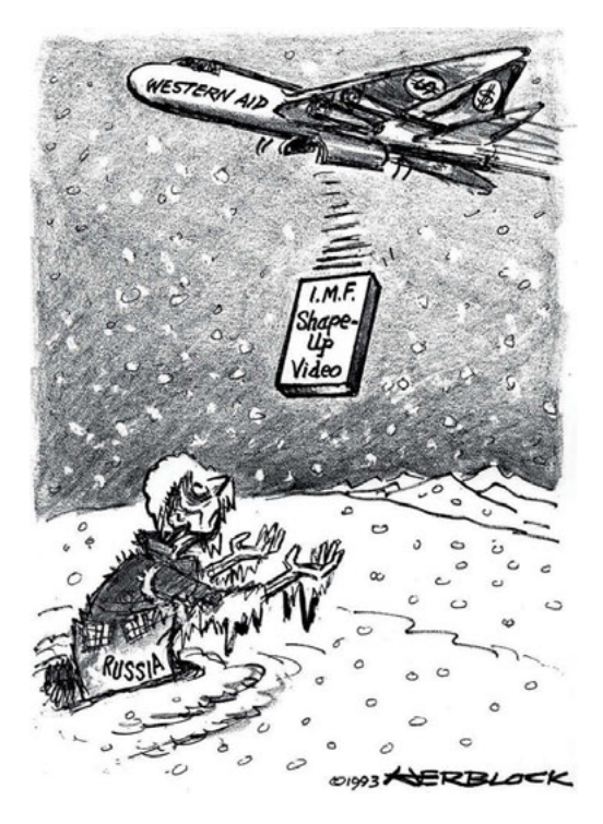
"AIR DROP"—A 1993 Herblock Cartoon, copyright by the Herb Block Foundation

By mid-April, when the Executive Board next met to discuss Russia's requirements, the government verged on collapse owing to parliamentary<sup>19</sup> displeasure with liberalization generally and with Gaidar's program in particular. From a financial perspective, lending to Russia under these circumstances was very risky. From a political perspective, failing to support the government was even riskier. Peretz (United Kingdom) put the dilemma starkly: "We have no alternative but to proceed on the assumption that a reform program of some kind will survive in Russia, and we must always fervently hope that it does, because it is extremely important."<sup>20</sup>