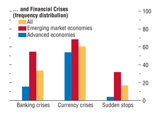
Figure 1.2.1. Credit Booms