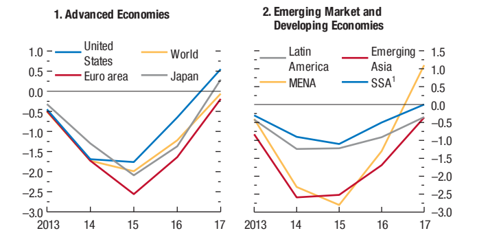
GDP Growth (percentage points)

GDP growth in all regions is well below the WEO baseline between 2013 and 2016,with global growth roughly 2 percentage points lower in 2015. Eventually, advanced economies have scope to ease monetary policy, which helps support growth toward the end of the WEO horizon and bring inflation back toward the baseline. Lower global growth translates into weaker demand for commodities, and the price of oil falls by roughly 30 percent after three years, with non-oil commodities falling by roughly 20 percent.