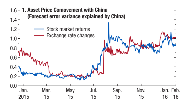
Figure 4.12. Transmission of Spillovers through Financial Channels