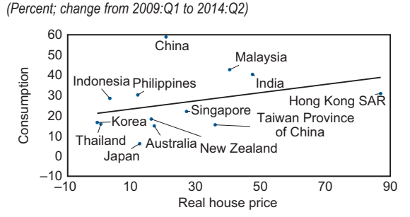
Figure 1.10.2 Real House Price and Real Consumption Growth