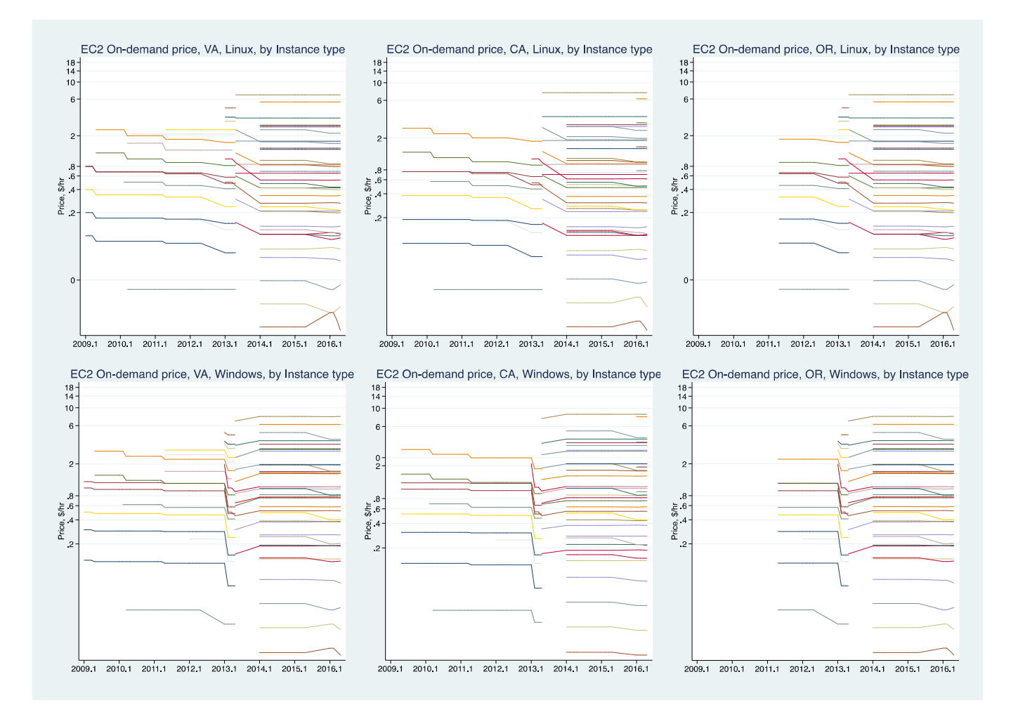
Figure 1 Amazon EC2 Posted Prices by Instance, for Each Region and for Linux and Windows