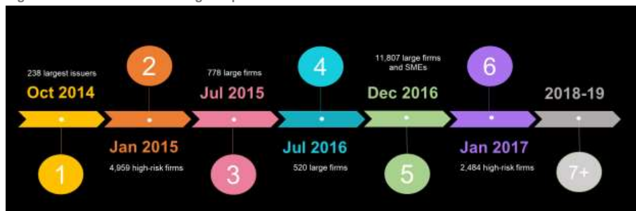
Figure 1. Timeline of e-Invoicing Adoption Waves in Peru

Note: This figure illustrates the stages of e-invoicing adoption in Peru. Reform waves are identified by their original adoption deadline. Large firms are defined as firms with sales >2300 UIT, medium with sales between 2300 UIT and 1700 UIT and small firms with sales below 1700 UIT.