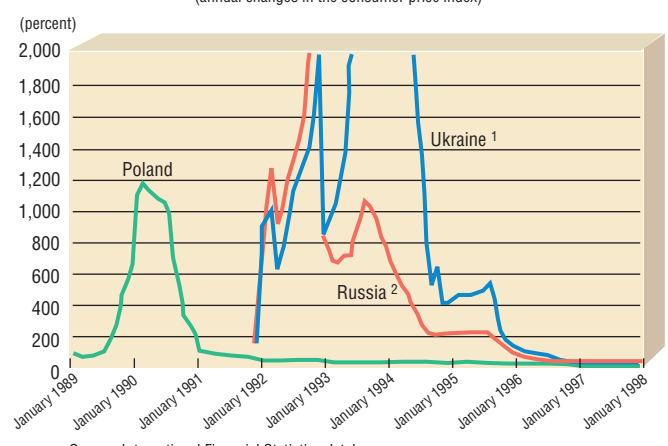
Chart 2 Some transition economies have achieved moderate inflation (annual changes in the consumer price index)

1 Inflation in Ukraine peaked at 10,155 percent in December 1993.