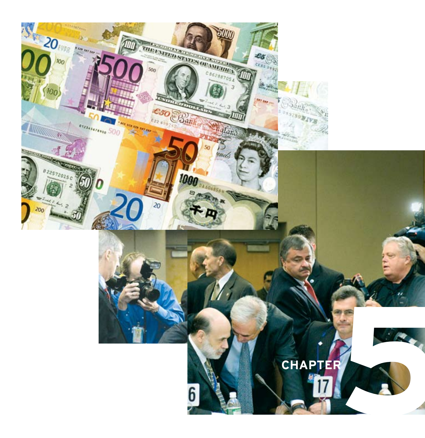
Finances, Organization, and Accountability