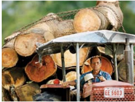
Sawmill at Rio Frio, Costa Rica, where a pioneering project seeks to harness energy from processed wood waste.

The report said the rapid growth of investment inflows to Africa partly reflects steps taken by countries to open up their economies to foreign investment. Measures included cutting taxes, establishing special investment zones, strengthening investment promotion, encouraging new business startups, and easing registration procedures. Some countries, however, enacted provisions that were less favorable to foreign investment, such as collecting royalties, extending state monopolies, inhibiting money transfers, and giving preferment to domestic nationals.