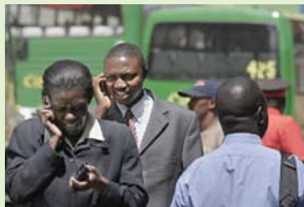
Mobile phone users in Nairobi, Kenya: A new agreement aims to link Africa’s major cities electronically by 2012.

tion superhighway would be an East African submarine cable between South Africa and Sudan that would bring fast and cheap bandwidth to at least 23 African countries.