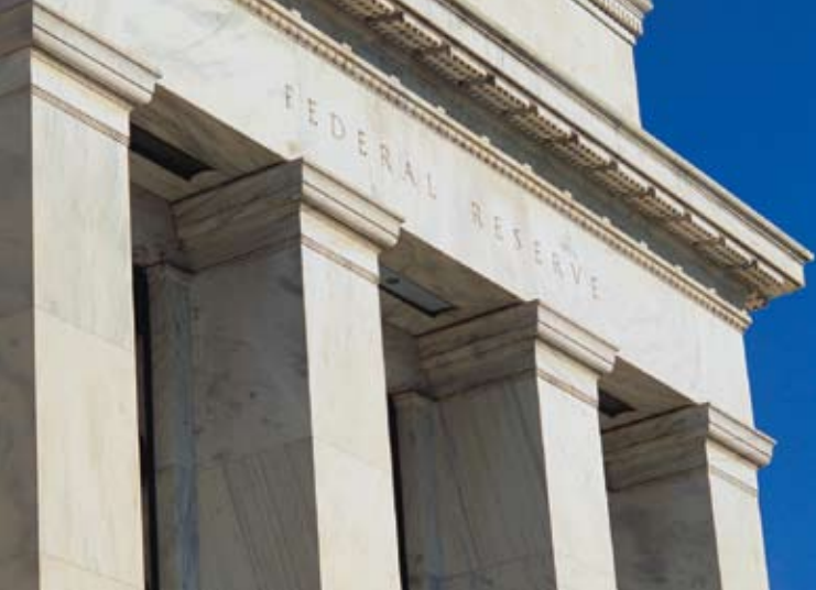
The U.S. Federal Reserve in Washington, D.C.

plex structured credit instruments have undeniably improved access to credit. However, they may also have contributed to greater aggregate risk-taking and, instead of resulting in an efficient dispersion of risks, have led to a destabilizing shift of risks toward institutions that could not adequately manage them, to the reversion of some of these risks to banks that had supposedly offloaded them, and to much more uncertainty about the actual distribution of risks among market participants. In addition, both banks and the off-balance-sheet special-purpose vehicles created in the securitization process have come to rely excessively on wholesale funding markets, thus incurring maturity mismatches without adequate consideration of the risks of such funding drying up. Although the originating and arranging entities lacked appropriate credit screening and monitoring incentives, many investors failed to sufficiently question such incentives or to examine the quality of the loans underlying structured products. Instead, they relied excessively on the reputation of the institutions involved and on the credit ratings of the instruments (FSF, 2008).