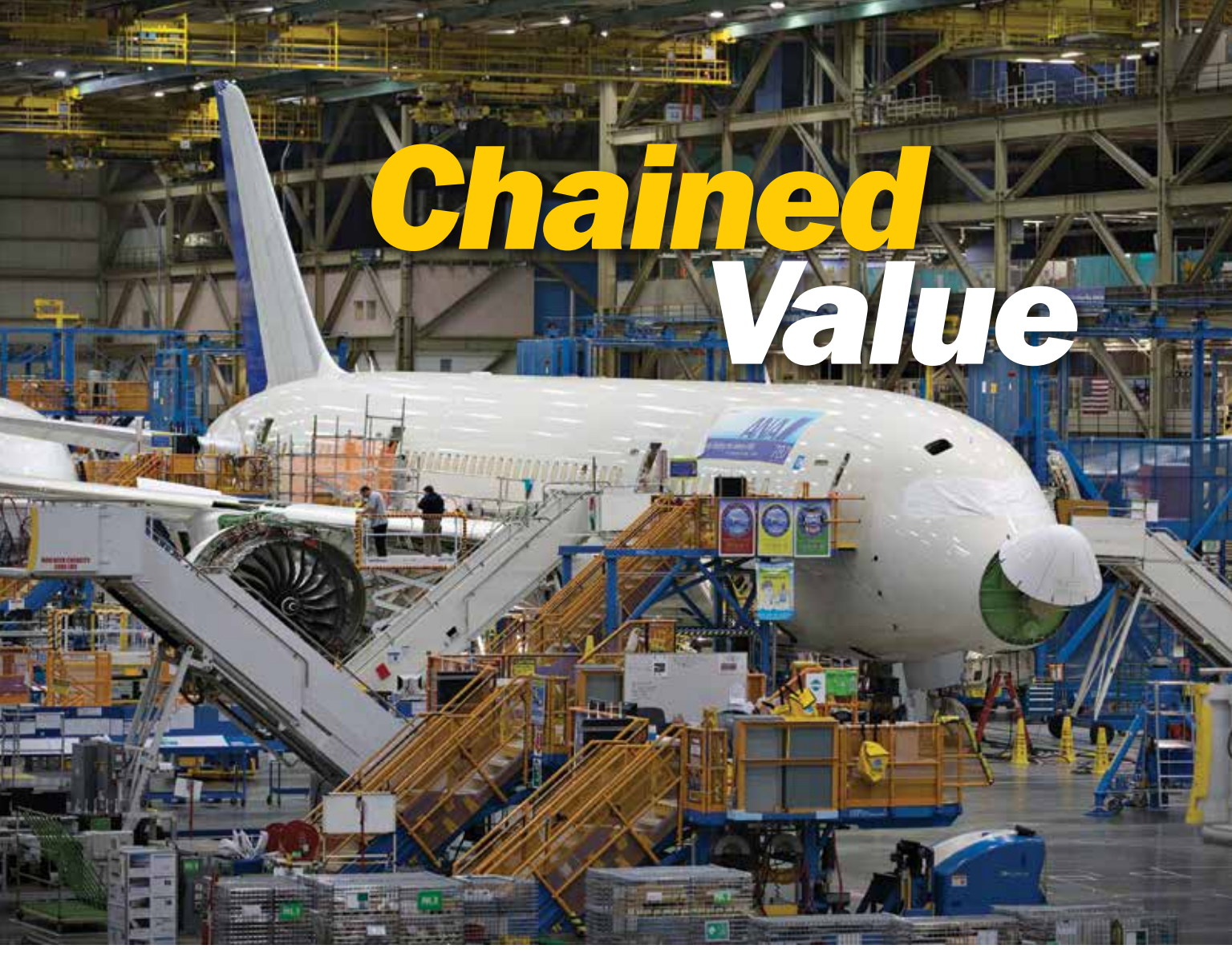
A Boeing 787 Dreamliner on the assembly line in Everett, Washington, United States.