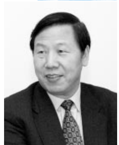
DAI Xianglong called for "a win-win globalization characterized by equality."