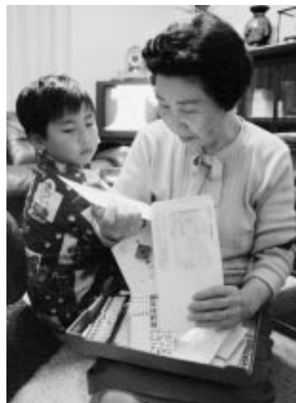
A sharp demographic shift in Japan will have macroeconomic implications for the young and the old.

Where Japan differs from other industrial countries is in degree. The rate of increase of Japan's elderly dependents is much higher than elsewhere. Ten years ago, Japan had the lowest share of elderly dependents among industrial countries; now it has the (Continued on page 343)