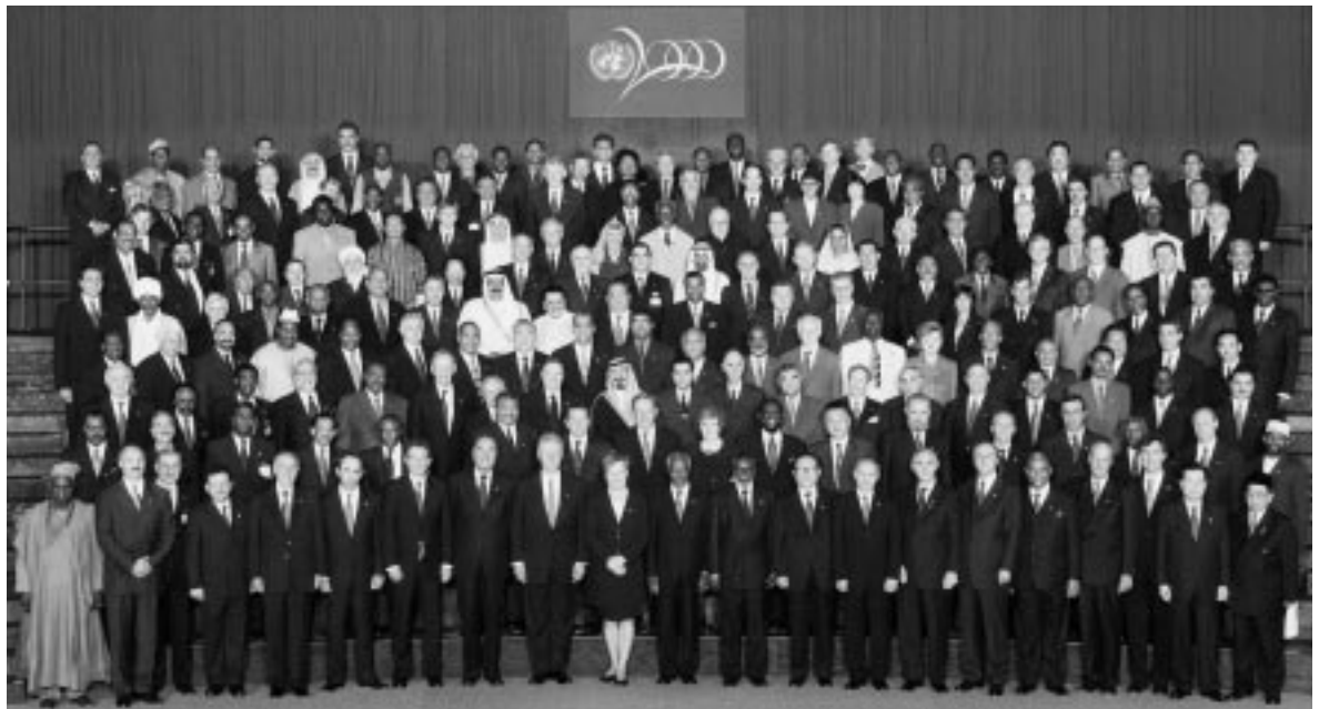
Heads of state and government from all around the world gathered together to participate in the United Nations Millennium Summit in New York.

heads of state a unique opportunity to engage in spontaneous, substantive dialogues on sensitive political, economic, and humanitarian issues. Many participating heads of state and government also spoke on other occasions and participated actively throughout the three-day event.