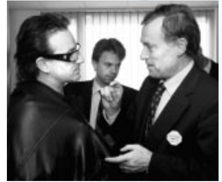
Bono (left) with IMF Managing Director Horst Köhler.

Rudiger Dornbusch of the Massachusetts Institute of Technology essentially recommended that every emerging market economy either adopt a currency board or directly use a strong currency like the U.S.