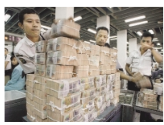
Unloading banknotes in Jakarta, Indonesia.

The policies to be adopted are designed not just to resolve the immediate balance of payments problem but also to lay the basis for sustainable economic growth by achieving broader economic