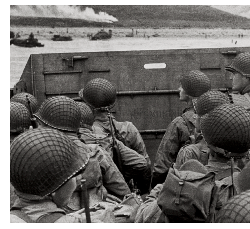
American troops land in Normandy on D-Day, 1944.

activity, while creation of an International Monetary Fund would help