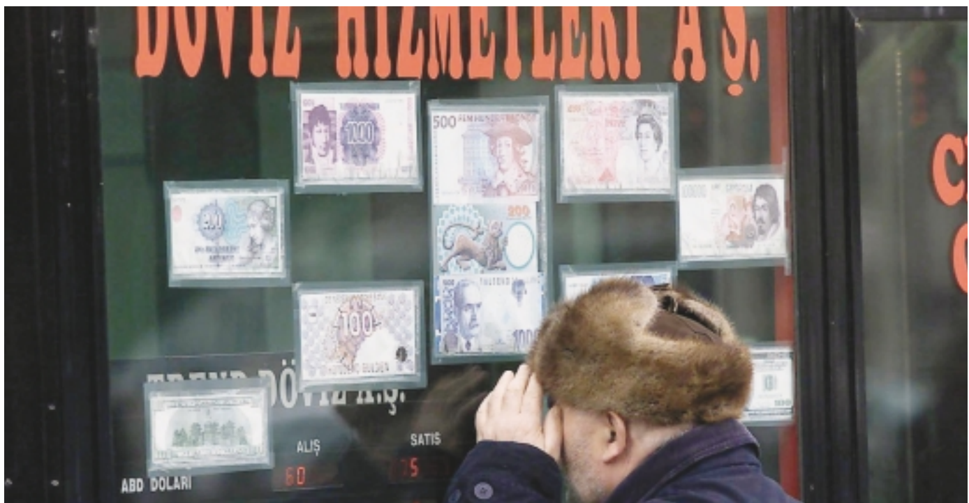
Checking exchange rates in Turkey during the 2001 financial crisis.

report) to provide timely and comprehensive analysis of developments in both mature and emerging financial markets and to identify potential fault lines in the global financial system that could lead to crisis.