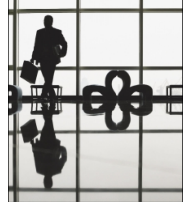
Setting new standards in Shanghai, China.

Lessons from the Mexican crisis of 1994-95 and the Asian crisis of 1997-98 prompted significant efforts to sharpen the focus of surveillance on crisis prevention. The IMF now monitors economic and financial developments more closely at the regional and global levels and advises its members to incorporate more "shock absorbers" into their policies-such as fiscal policies that leave room for larger deficits in difficult times, adequate reserve levels, efficient and diversified financial systems, exchange rate flexibility in many cases, and more effective social safety nets. And it has intro-