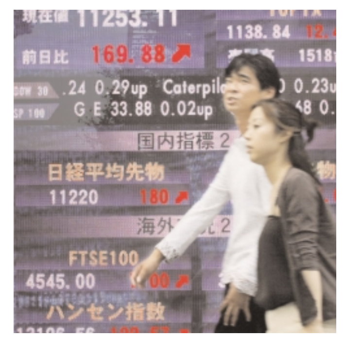
A couple walk past an electronic display of stock prices in Tokyo.

nized the Socialist Republic of Viet Nam as the successor government. The larger effect, however, was on the U.S. economy and its external payments position. In combination with a sizable increase in domestic spending on President Lyndon Johnson's Great Society programs, the rise in external military spending gradually worsened the overvaluation of the U.S. dollar under the Bretton Woods system of fixed exchange rates. In a series of spasms, the system dissolved between 1968 and 1973. With the dollar no