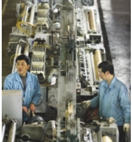
Checking textile machines in China. IMF technical assistance has helped China's reform process.

Through staff missions sent from headquarters, the provision of specialists on a short-term basis, resident advisors, and training in the field or at the Fund's headquarters or its regional training institutes, the IMF offers technical assistance in the core areas of its expertise. These include macroeconomic policy formulation and management; monetary policy; central banking; the financial system; foreign exchange markets and pol-