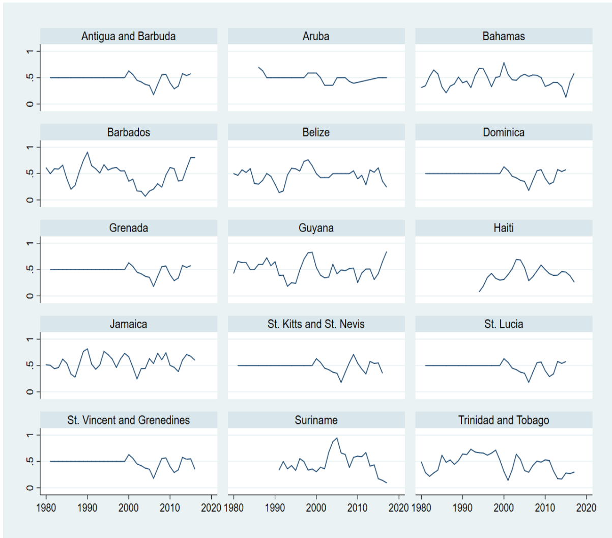
Appendix Figure 1. Monetary Independence Index, 1980–2017