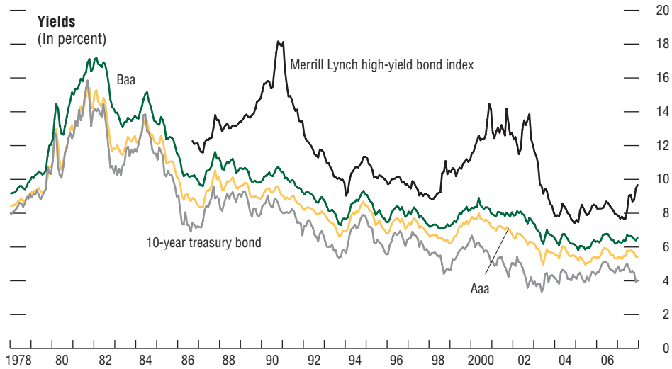
Figure 3. United States: Yields on Corporate and Treasury Bonds (Monthly data)